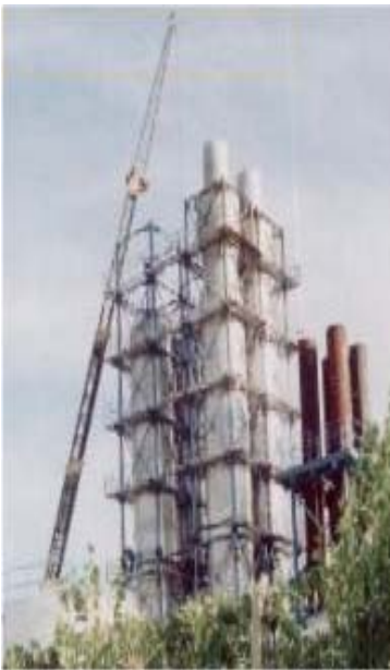
At IDIL Electric Power Plant (Rolls Royce Power Venture), a Kare-Engineering FGD system is used to convert this 57,5 MW station to Clean Air Act compliance.